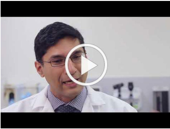
Video #1: About the Selikoff Centers for Occupational Health