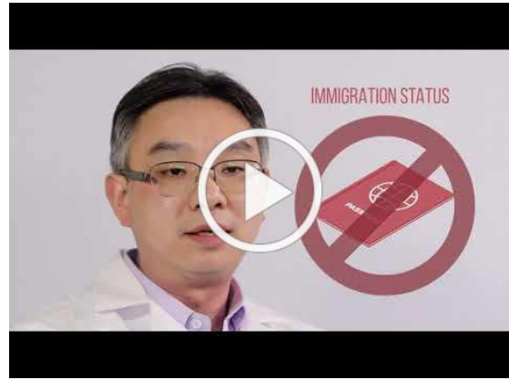
Video #2: Medical Treatment Under New York State Workers' Compensation